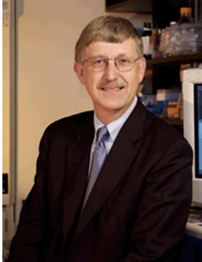
Francis S. Collins, M.D., Ph.D.