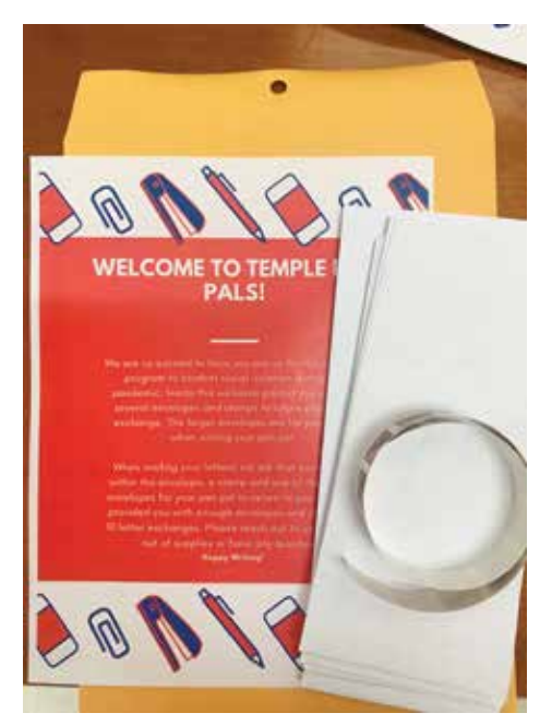
Participants in the Temple pen pal program receive a welcome packet with their first letters.

most vulnerable have increased the prevalence of social isolation among older Americans, putting them at greater risk of depression, falls, hospitalization, all-cause mortality, and cognitive decline. Social distancing, alongside shortages of personal protective equipment, has also limited the variety of clinical experience and service opportunities available to healthcare students as they strive to build their knowledge base, communication skills, and connections to the communities they will serve.