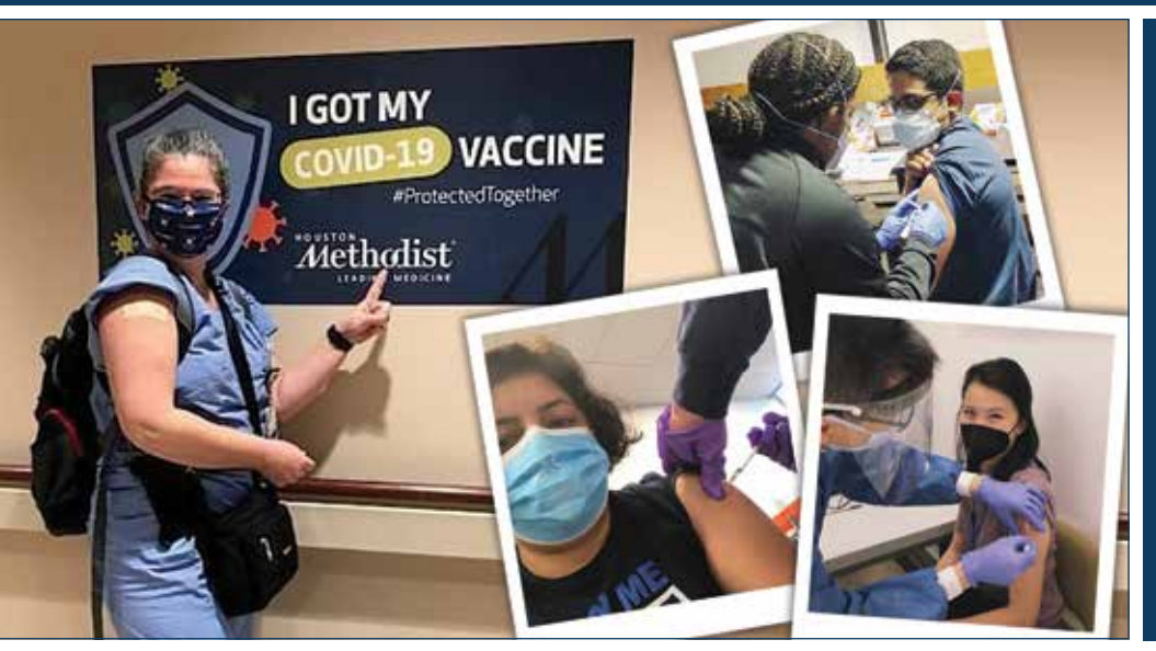
AGS members show their pride while getting COVID-19 vaccinations. If you'd like to share a vaccine photo and story, post it to Twitter and tag @AmerGeriatrics using #MyCOVIDVax and #ThisIsOurShot.