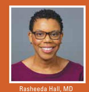
Duke University School of Medicine

A normal day in my life looks like at least a couple of hours writing a manuscript or a grant. The rest of my day may be interpreting research findings, attending research meetings, or seeing patients in my clinic. I have been grateful for my geriatric